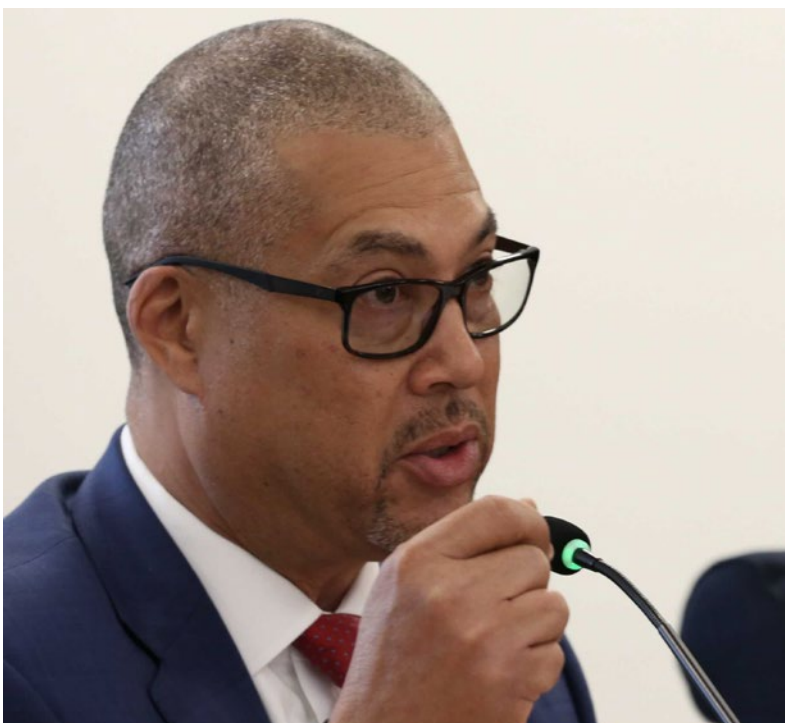
BART’s Independent Police Auditor Russell Bloom

At the recommendation of the BPCRB, BART Police was an early adopter of a policy aimed at ensuring equity for the transgender community. The policy is the result of input with stakeholders in the transgender community, as well as with police, union representatives, and other community stakeholders, including the Transgender Law Center in Oakland and the National Center for Transgender Equality.