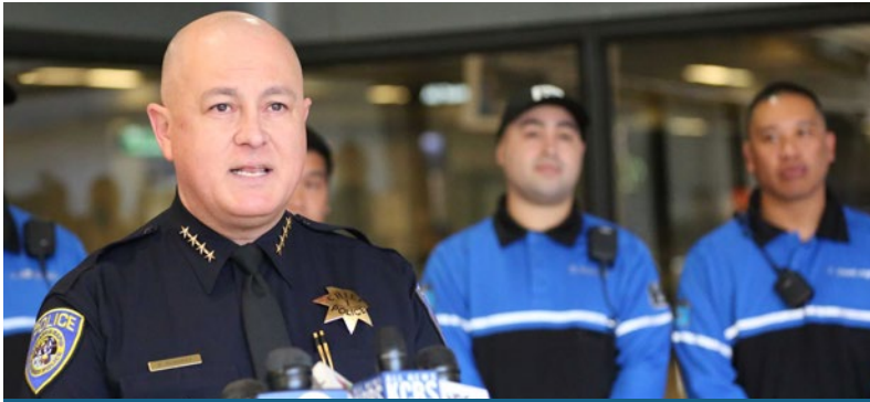
BART Police Chief Ed Alvarez

The accreditation caps a process of implementing recommendations from The National Organization of Black Law Enforcement Executives (NOBLE) final report issued in 2010.