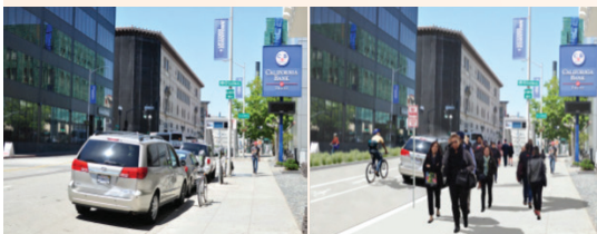
20th Street (Before & After)

Second, implementation of the City's 20th Street Complete Streets Plan will provide an enhanced multimodal transportation corridor between the 19th St/Oakland BART station and nearby housing, employment, retail, and entertainment, as well as link to recreational opportunities at Lake Merritt. The proposed redesign of 20th Street includes a "road diet" which would right-size auto capacity from six to four lanes, widen overcrowded sidewalks and provide for new bike lanes. Landscaping and the installation of public art will further transform an inefficient urban arterial into a public place and community asset, with the intersection of 20th Street and Broadway above the 19th St/Oakland BART station serving as the heart – or Gateway – to the surrounding Uptown District.