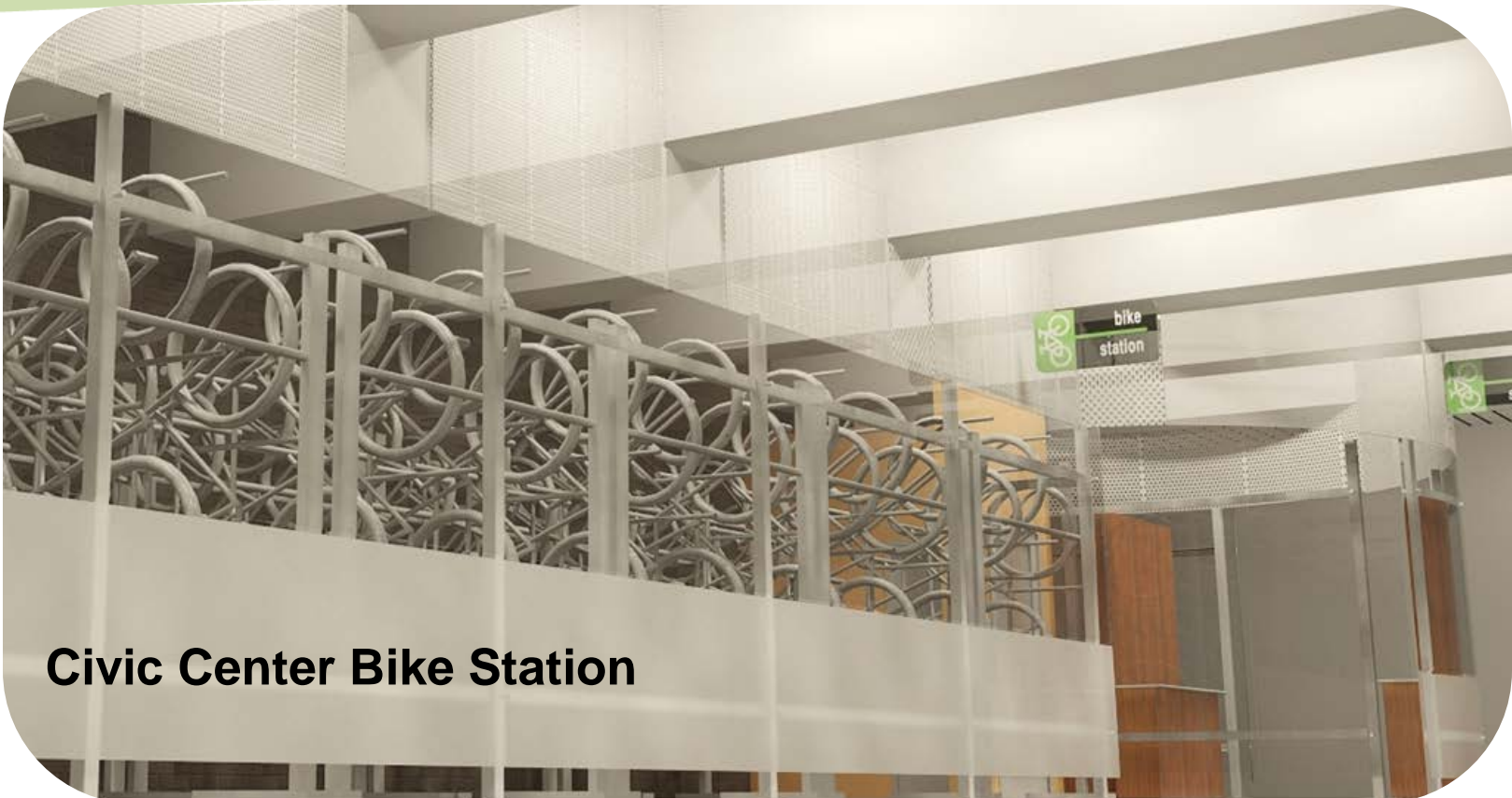
Civic Center Bike Station