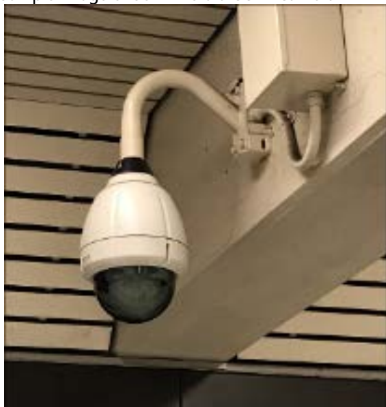
Sample Image of Semi-Visible CCTV Camera

The various types of cameras that are employed for public surveillance purposes include visible and semi-visible, each having its own purpose. Visible cameras are intentionally designed to be visible to the public and for the most part, one can easily detect what is being recorded by the direction of the camera. Semi-visible cameras have become increasingly more common. These cameras have a dome-shaped covering that prevents the public from identifying the direction the camera is facing. For crime prevention efforts, this type of camera is more effective for deterrence purposes because would-be offenders are unable to determine whether they are being recorded and may therefore refrain from criminal activity due to fear of apprehension.