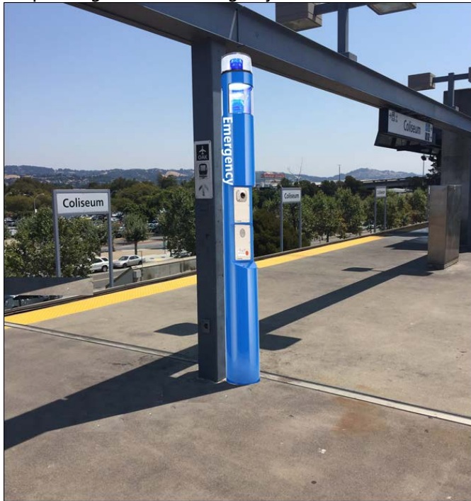
Sample Image of Public Emergency Phone Tower

The Public Emergency Phone Towers are intended to act as an additional security precaution in public areas. By having these highly visible, and easily accessible blue light phones, the community is continually reassured that they can summon police assistance immediately. The BART Police Department 911 dispatch center will automatically know where the call is coming from and quickly dispatch an officer to the exact location. At night a blue light atop the phone is automatically lit making them easily visible from long distances.