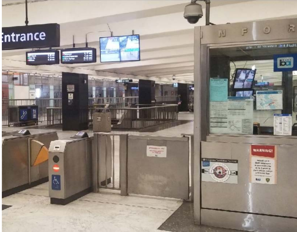
Sample Image of CCTV Public Video Monitor

The CCTV Public Video Monitors is a large format color LED or equivalent video monitor mounted above the entrance to a BART station jointly determined by BART police department and BART Operations as part of the Districts Fare Evasion and Public Safety measures.